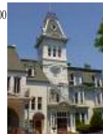
The Wisconsin Club, formerly the Mitchell Mansion