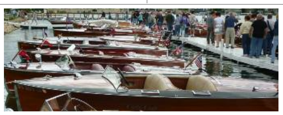
Forty-two watercraft registered for The 2009 Pewaukee show