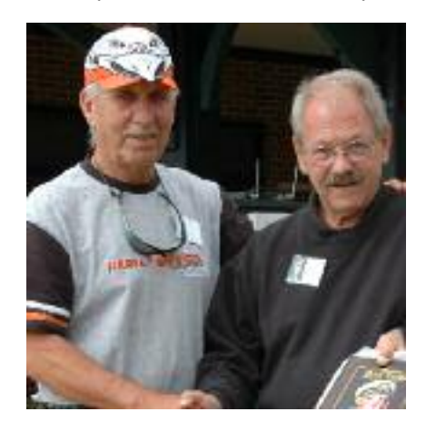
Peter Harken People's Choice 24ft 1982 Zeb Craft