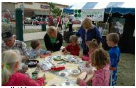
All 100 toy boats were painted and gone within 2 1/2 hours