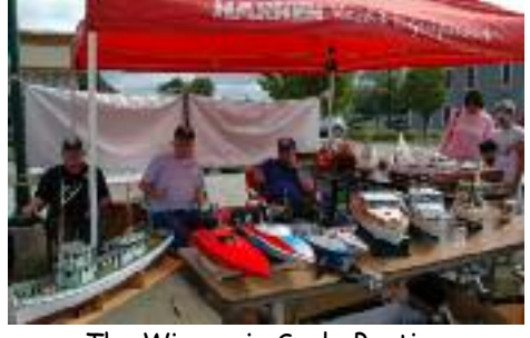
The Wisconsin Scale Boating Association set up their model boats.