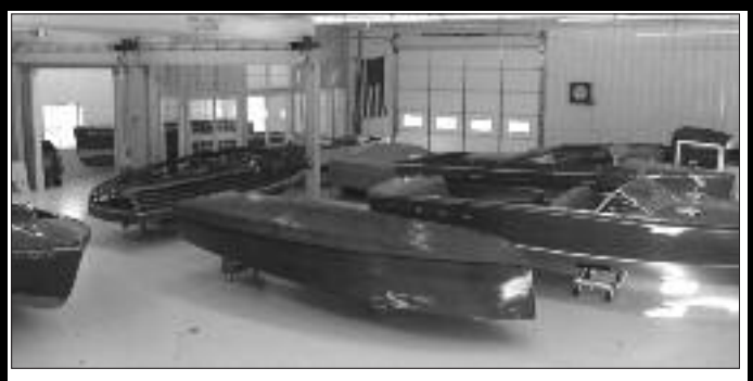
Your authorized dealer for: ★ Custom EAGLE® boat trailers ★ ShoreStation lifts and piers ★ heavy duty boat dollys

N68 W33680 County Rd. K Oconomowoc, WI 53066 office: 262-966-3347 cell: 414-916-3347